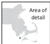
Area of detail

This map depicts the Marine Fisheries' sanitary classification of shellfish growing waters in accordance with the National Shellfish Sanitation Program. It does not indicate the current status, either "open" or "closed" to harvesting due to shellfish management or public health reasons. Always confirm the status with local authorities and/or Marine Fisheries. Information on this map may be out-dated or otherwise incorrect, and should not be relied upon for legal purposes.